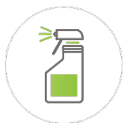
750 ML SPRAY BOTTLE *1L SPRAY BOTTLE