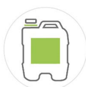
20 KG DRUM